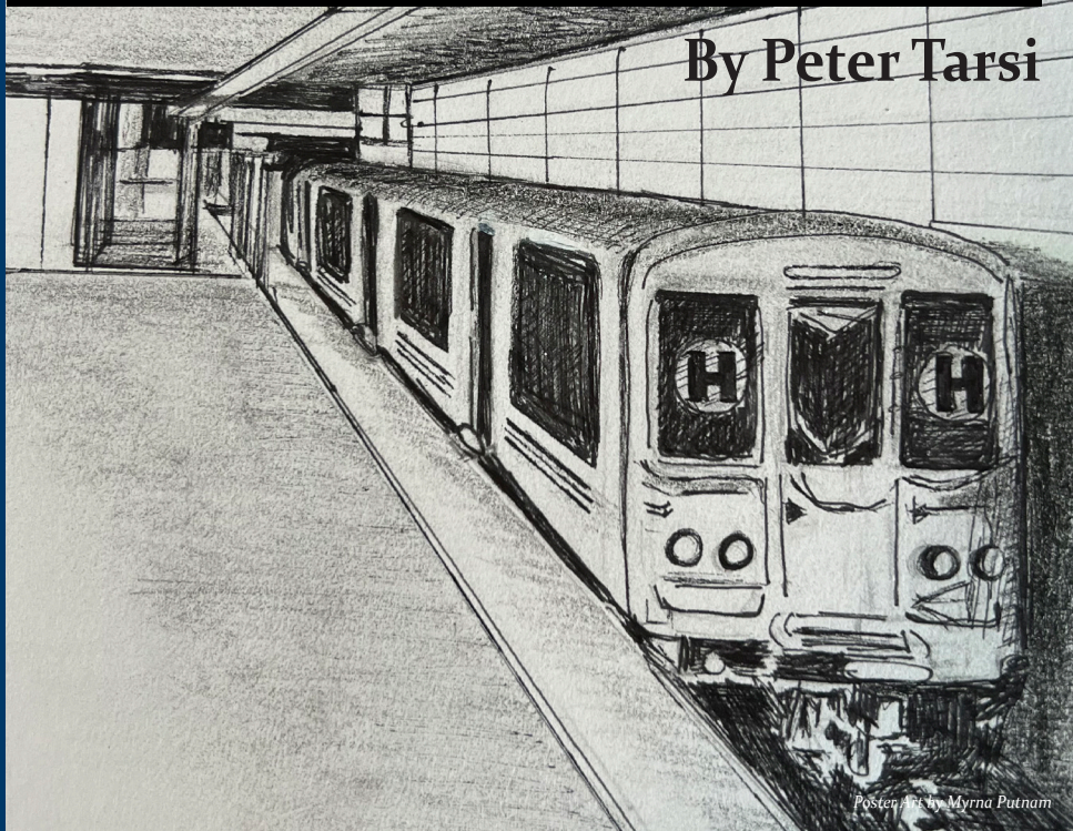
Poster art by Myrna Putnam